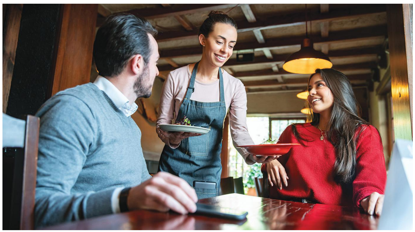
Long-term care is losing certified nursing assistants and other frontline positions to food service and retail competitors, which are offering about the same or more for jobs that require no special training or certification. This has been one of the major predicaments of the long-term care industry.

Worker shortages may be improving on paper, but challenges remain