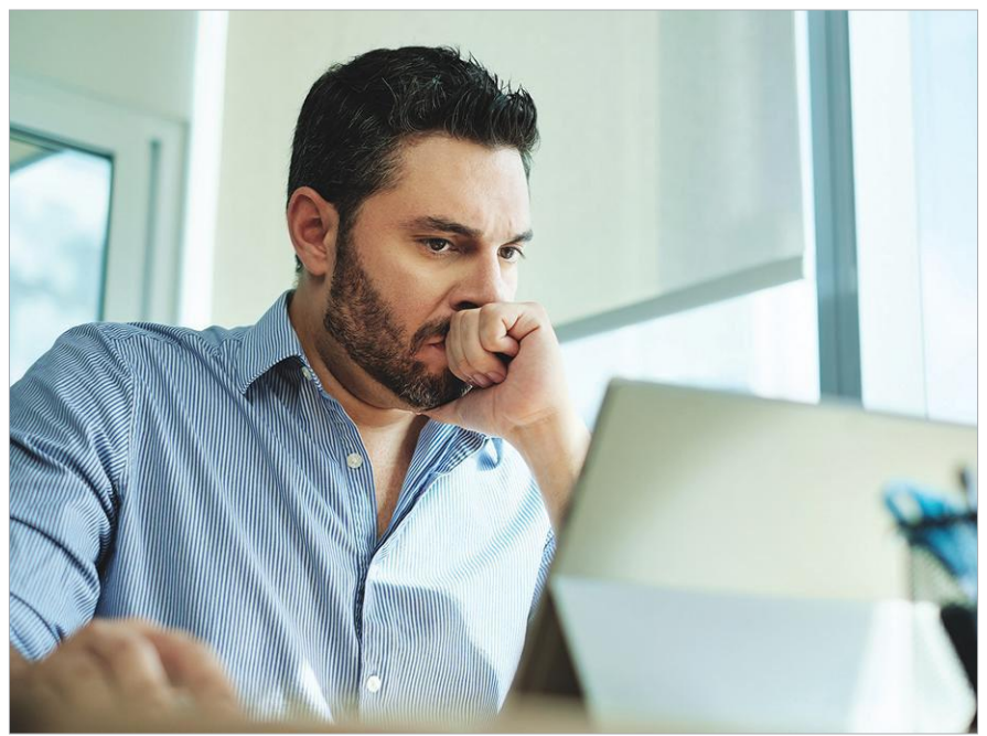
Frontline workers are not the only ones experiencing burnout as a result of the pandemic. The stress also has affected upper-level management, some of whom have opted for early retirement.